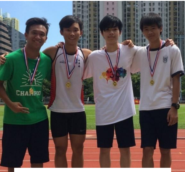
The winners display their gold medals. Sports Day at Sheung Shui Po Sports Ground October 12, 2017.