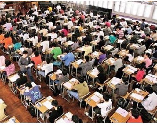
Next Issue of The Chiu Chow Post : Crystal Cheung 2A (5) writes about if students should have to pay to sit at public exams.